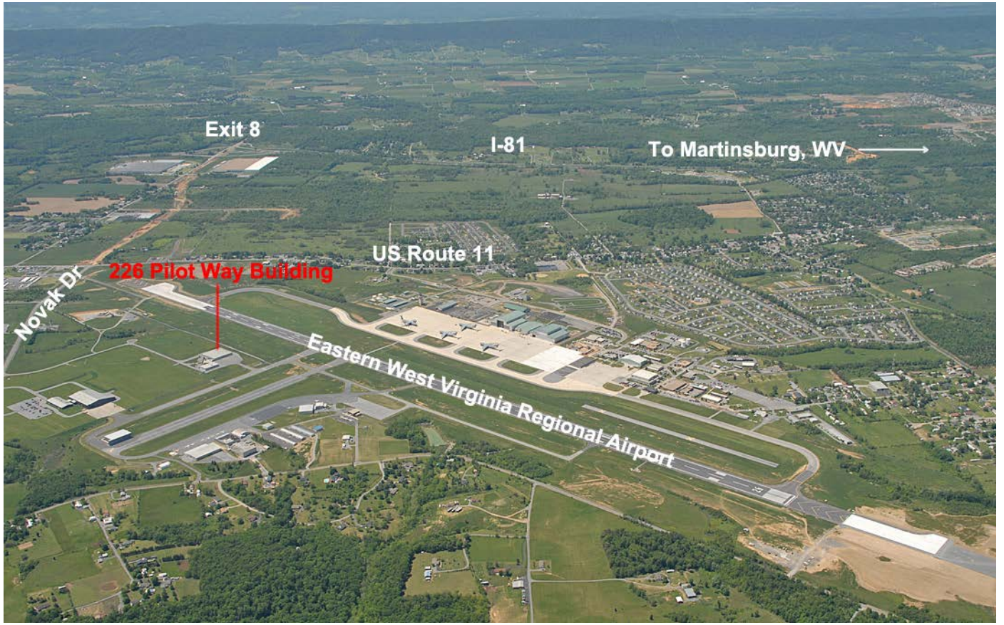
BUILDING LOCATION AT EASTERN WEST VIRGINIA REGIONAL AIRPORT